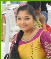
Roraract club President: