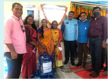
All project partner Club presidents with DG