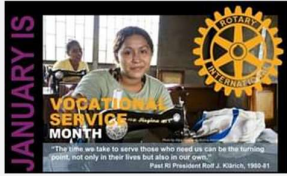
Visiting Club member's factory.