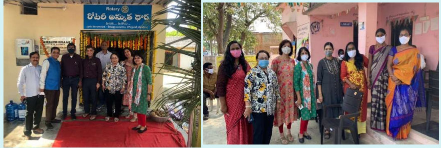
Club members and project partner club members at project inauguration