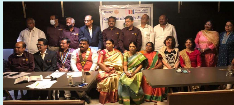
DISTRICT GOVERNOR'S GOODWILL VISIT TO CLUB